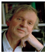
Rupert Sheldrake, PhD ENGLAND